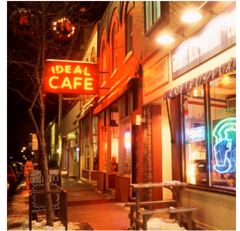
The new development should complement, not compete, with the economic vitality of downtown Northfield.