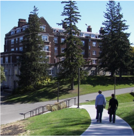
Northfield desires to expand their economic base and improve their rate of college graduate retention.

Planning for the Northfield Business and Industrial Parks was the result of recommendations outlined in the 2006 Northfield Comprehensive Economic Development Plan and the 2008 Northfield Comprehensive Plan. The Comprehensive Economic Development Plan assessed community strengths, weaknesses, opportunities and threats to Northfield's economic development potential. It notes that while Northfield enjoys a highly educated workforce, an authentic downtown environment, and two world-class colleges, Northfield lacks industrial space and the land resources to accommodate future commercial business development. It also points out a low rate of college graduate retention, linked to the lack of job potential in Northfield. Both policy documents identify the need to diversify and expand Northfield's economic base and make land available for business expansion, particularly for the expansion of existing businesses, but also to make land available for business expansion in the following target industries: